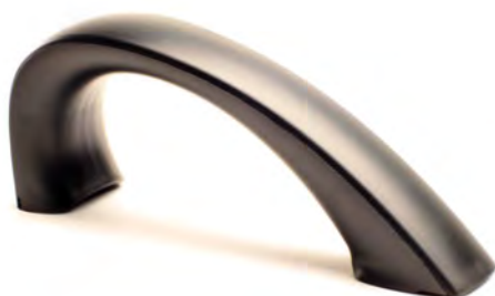
Appliance grip (Mould with 0.5T) Appliance.

The wish to keep improving, with an investment in new technologies and consistent given proof after all its lifetime, makes PMPM a solid company and one that is ready to take on new challenges.