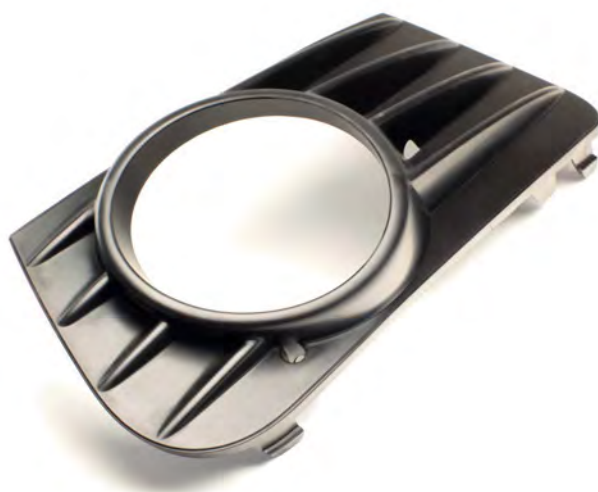
Front fog lights grid (Mould with 1.5T.) Automotive.